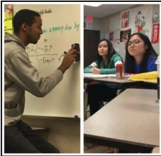
Winner of the J-Quiz last year coaching this year's winners from Eastview High School before National Japan Bowl

Concerning the National Japan Bowl, I feel very calm despite the huge challenge that is facing us. I know my team well and even though we each have our weak points, our team work has led us to this moment and that won't let us down. The