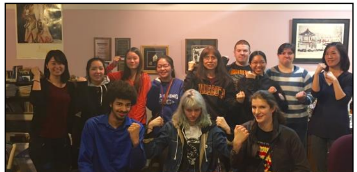
The winning teams of 2016 J-Quiz meeting at JASM office