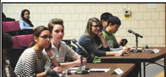
2015 J-Quiz competitors in the Final Stage

For J-Quiz, JASM Board Members and coordinators have been working diligently with their committee members well in advance in order to prepare questions, recruit volunteers and arrange the facility for the competition on Feb. 13 th . The day of the contest will start early on Saturday morning with registration of teams of students, followed by the Writing of Essays and the Preliminary Round. After a Bento Box lunch for each student, the real excitement can be seen at the Final Rounds of competition that begin early in the afternoon. Admission is free and open to the public.