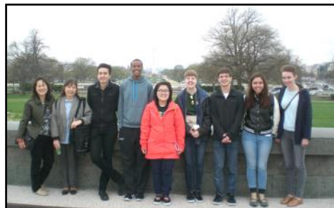
2015 J-Quiz Winners in Washington D.C.

If you are interested in being a part of JASM's efforts to send these students to Washington, D.C., please visit http://mn-japan.org/programs/fundraising-campaign/ or call 612-627-9357 for donation payment.