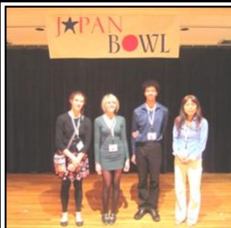
Students and their teacher at National Japan Bowl

There's so much I still don't know about Japan and I'm eager to study and learn more about the art and history, and all the small, beautiful details of the culture. Because of Japan Bowl and my participation in the Japanese program in the past 4 years, I know I will continue to study Japanese culture and language in college and afterwards. I'm so thankful for having had this opportunity, and can't thank