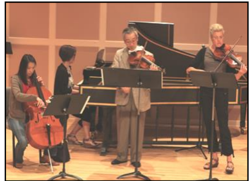
From Harukaze Concert 2014