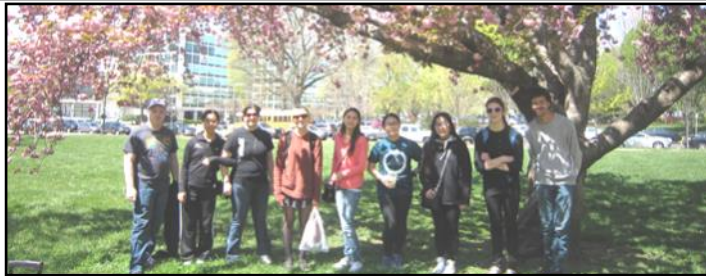
Three Winning Teams of J-Quiz from Minnesota in Washington, D.C.