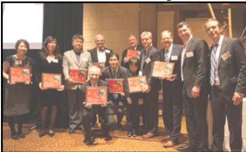
Recognition of sponsors with certificates