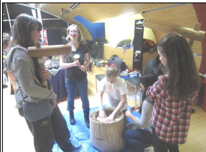
Shinnenkai 2016 mochi (Japanese rice cake) making

NEW LOCATION Washington Technology Magnet School Great Hall 1495 Rice Street Saint Paul, 55117