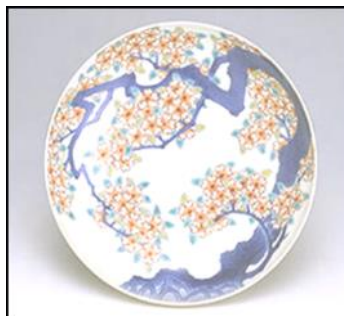
Japanese ceramic dish

This 12 night/13 day tour will begin in Kyushu on May 12th and end in Tokyo on May 24th, 2017. It will be featuring traditional and contemporary crafts, architecture and gardens along with visits to pottery sites and art studios not usually included on such tours. In this trip, we will start in Kyushu continue to Takamatsu, Osaka and end in Tokyo. We will visit individual pottery studios where talented ceramic artists produce both traditional pots and sculpture which break with the past, a center for basketry and the premier fabric designer in Japan. We will not only explore "off the beaten" areas of Japan where ancient arts are still being produced in rural settings, but also metropolitan areas of Japan where traditional arts and contemporary expressions co-exist in an urban environment.