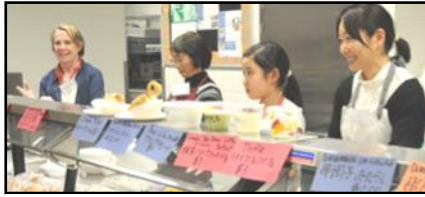
Kitchen Crew and their amazing food

Those fascinated in more traditional Japanese art experienced tea ceremony performances ( otyakai ) with Susukikai, the beautiful ikebana creations of the Sogetsu Study Group, and mastering the kendama . Through the Bloomington Sister City Organization, Concordia Language Villages, Nihonjin Kai, Twin Cities Japanese American Citizens League (JACL), Nagomi-Ya Senior Living, and St. Paul Sister City Committee, community building between the cultures of Minnesota and Japan were promoted. Exhausted by all these amazing events and delicious food, Zen Healing Center offered free massages to relax and then jump back into the exciting festivities this event had to offer.