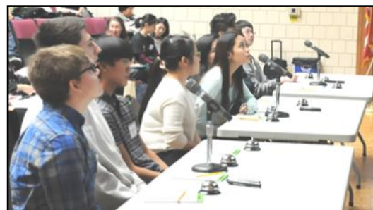
2016 Level II Final Round Participants

If you are a parent or friend that would like to support your student, ask them what time their finals will occur.