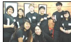
2016 Shakopee High School Participants

8:00 a.m. — Opening Ceremony 9:40 a.m. - 10:30 a.m. — Cultural Class 10:40 a.m. - 11:30 a.m. — Cultural Class (Repeat) 12:30 p.m. — Final Rounds, Closing Ceremony, and Award Presentation