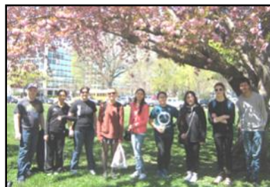
Minnesota students under cherry blossom tree

J-Quiz is not only for the students and their teachers participating, but also other people who are interested to learn more about Japanese Culture or cheer on friends and family that are competing. During this event, there will be a two cultural events that are free and open to the public and will be held during 9:40 a.m. and 10:40 a.m. Come check out this event and afterwards cheer on your family and friends or just come watch the final rounds of J-Quiz at 12:30 p.m.! We invite everyone to check out the cultural presentations and also watch these students show their knowledge for the final competition.