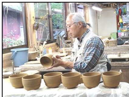
Japanese potter examines his art work.

Airfare is not included. Tour members can arrange their own transportation from any city in the United States and Canada to Japan, and return.