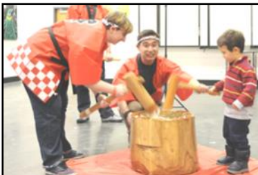
Mochi Pounding Demonstration