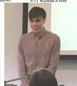
Rehearsal at the UMN for Speech Contest