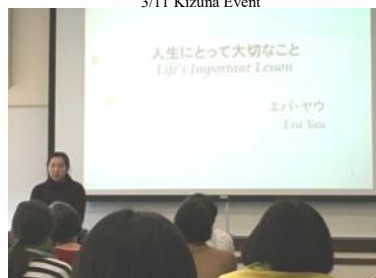
Rehearsal at the UMN for Speech Contest