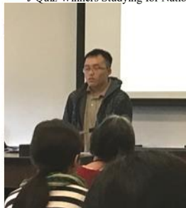
Rehearsal at the UMN for Speech Contest