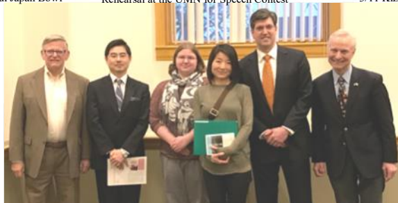
3/11 Kizuna Event