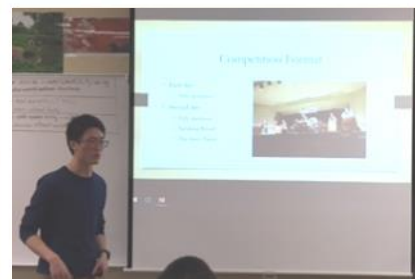
J-Quiz Winners Studying for National Japan Bowl