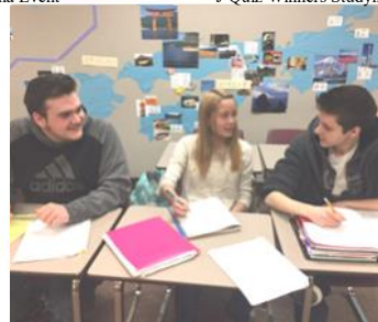
J-Quiz Winners Studying for National Japan Bowl