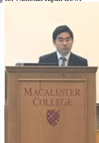
3/11 Kizuna Event