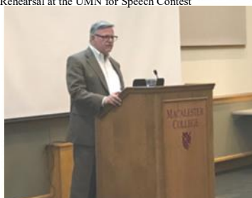
3/11 Kizuna Event