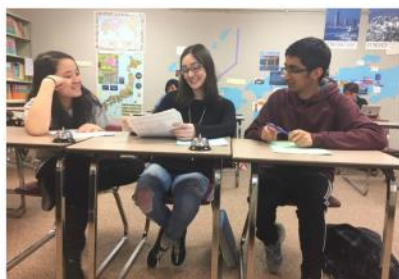
J-Quiz Winners Studying for National Japan Bowl

The Japan America Society of Minnesota is a member of the National Association of Japan-America Societies.