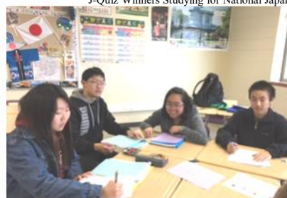
J-Quiz Winners Studying for National Japan Bowl