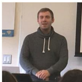
Rehearsal at the UMN for Speech Contest