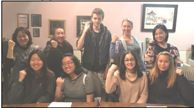
The winning teams of 2017 J-Quiz meet at JASM office