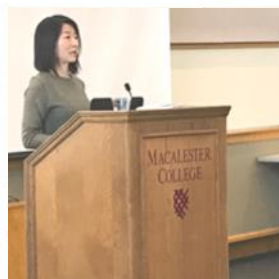
3/11 Kizuna Event