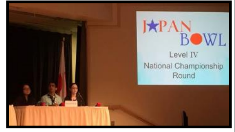
Eastview Level 4 at the Championship Round

"I was very nervous about the competition. But when we got there, I was full of excitement!