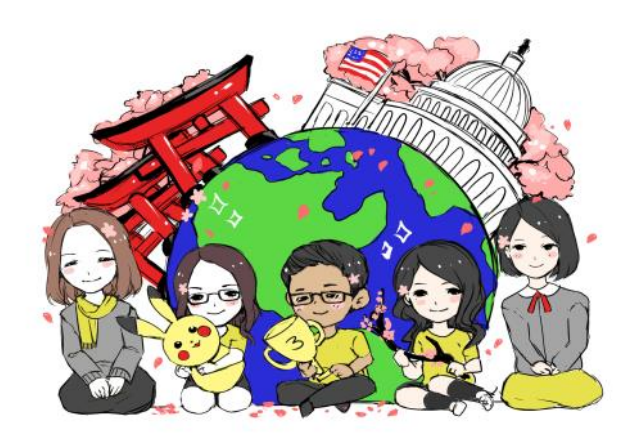
Illustration by: Cat-Thy Trinh