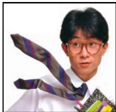
Senri Oe in his 1984 album, Pleasure

In 2008, Senri Oe shelved his highly successful 25-year career as a Japanese pop star and actor to move to New York City in pursuit of a childhood dream—