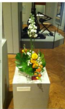
Above: Ikebana Display by Yoko Toda