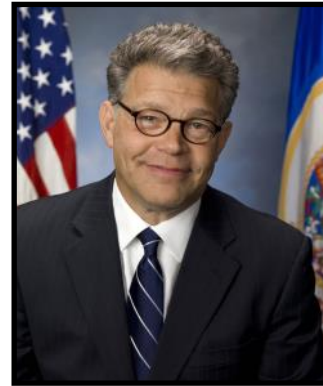
U.S. Senator Al Franken

JASM is very pleased to announce that U.S. Senator Al Franken will be the keynote speaker at the Mondale Award and Scholarship Gala at the Oak Ridge Country Club in Hopkins on Saturday, October 28.