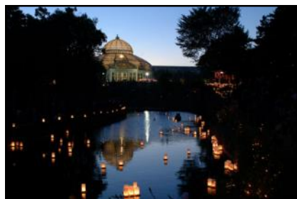
Lanterns from Obon 2015

Come and have a good time August 20th by celebrating the Obon Festival at Como Park. The largest Japan-related event in Minnesota, the event features food, performances, cultural demonstrations, and activities for adults and kids. Come and watch the Mikaharukai dancers, a Taiko performance, fish for goldfish, or just come and enjoy some good food. There will be something to do throughout the day. As sunset approaches, be sure to make your way to the water, where paper lanterns will be lit and set afloat, a practice which is believed to guide the souls of dead ancestors back to their old homes on earth. The Obon Festival is a great way to experience Japanese culture, and while enjoying a Japanese festival in Minnesota on a Sunday in August.