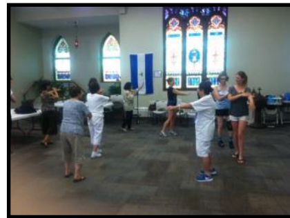
Volunteers and Mikaharukai Dancing

At the Obon Festival, Mikaharukai will be teaching the dance to anyone who is interested, and they will all have the chance to join them in performing the dance in a large group on the performance stage.