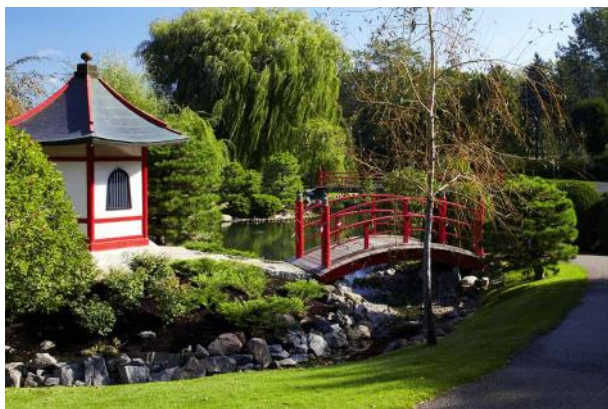
The Normandale Japanese Garden

From 11:00 A.M.-5:30 P.M. on September 23rd, the Normandale Japanese Garden will be hosting its fourth annual Japanese Garden Festival located at 9700 France Avenue S, Bloomington MN. Be sure to go and enjoy the many highlights of the festival, including Taiko performances by both Taikollaborative and Harisen Daiko, martial arts exhibitions, dancing, Ikebana, koi feeding, as well as an abundance of food and beverages.