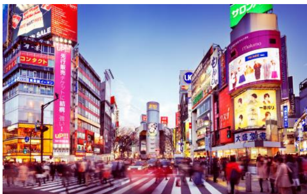
Fly ANA to Tokyo, Japan

You can make a bid for the air tickets by visiting www.32auctions.com/us-japan