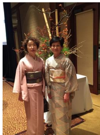
Guests wearing kimono at the 2016 Mondale Gala

If you wish to wear a kimono for the 2017 Mondale Gala and require assistance for the event, be sure to fill out a registration form by October 16th, 2017. Upon your reservation, a $20 fee is requested for the service. Do not forget to bring 3 koshi himo (cord or strips of cotton) and 2 thin towels as well. You will be contacted for the appointment and the details before the event. To fill out a form, please visit http://mn-japan.org/2017/09/20th-annual-mondale-award-and-scholarship-gala-2017/