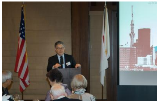
U.S. Senator Al Franken giving the Keynote Speech.