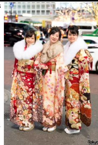
Young women wearing furisode on Coming of Age Day

Aside from parties with friends and family, attending a local shrine is a popular activity that is done on Coming of Age Day. Most women wear furisode on Coming of age day, while young men wear Western clothes or hakama .