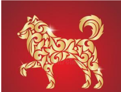
2018: Year of the Dog!

新年おめでとうございます。 本年もどうぞ、よろしくお願い致します。皆様のご健康とご多幸をお祈り申し上げます。