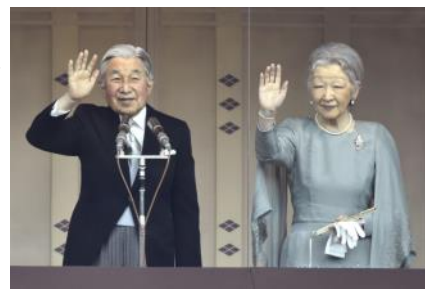
Emperor Akihito and Empress Michiko

The Emperor's Birthday is a national holiday in Japan that is currently celebrated every December 23rd, as that is Emperor Akihito's Birthday. During the reign of Emperor Hirohito (Showa period, 1926-1989), the holiday was celebrated on April 29th.