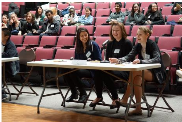
Photos from the 2017 annual J-Quiz

Everyone is welcome to watch the Final Rounds in the afternoon on February 17th. For more information, please contact the JASM office at 612-627-9357.