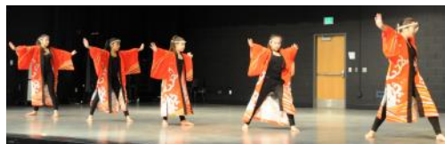
New Thunder Wave

Shinnenkai brought people of different backgrounds and cultures together, all sharing a common interest in celebrating a traditional Japanese New Year. This event could not have been possible without the support of our donors, exhibitors, performers, and volunteers! The generosity and support is greatly appreciated. JASM looks forward to another great Shinnenkai Celebration next year, and hopes to see everyone in 2019!