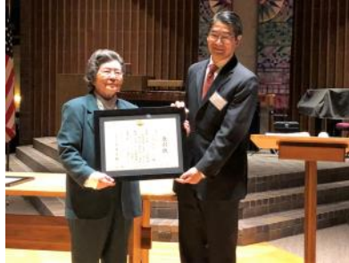
Consul General Ito Presenting Certificates of Commendation