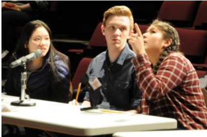
Shakopee HS Level II Winning Team

On April 12th-14th, the winners of 2018 J-Quiz competition will journey to Washington D.C. for an exciting opportunity to participate in the National Japan Bowl as well as experience the nation's capitol and attend the Sakura festival! This is an exciting time for the students who worked so hard to compete at J-Quiz and will now have the opportunity to take their studies to the next level and challenge students from around the country- we wish them the best of luck!