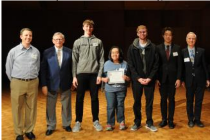
Shakopee HS Level III Winning Team