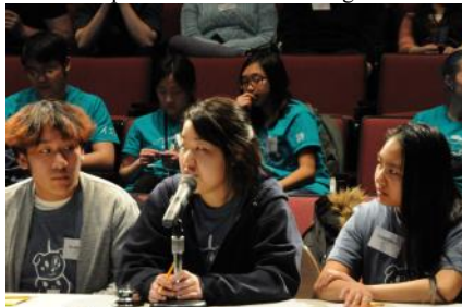
Harding HS Level IV Winning Team

The opportunity for these students to travel to Washington D.C. was made possible by the following sponsors: