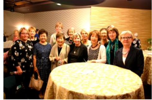
Some members of the St. Paul/ Minneapolis Sogetsu Study Group

It takes a lot of skill and practice to pull together such beautiful floral arrangements. The meticulous detail within each piece was stunning. JASM would like to thank the members of the Minneapolis/St. Paul Sogetsu Study Group: