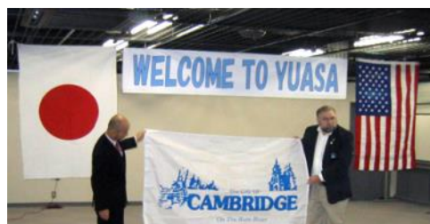
Cambridge contact visiting Japan