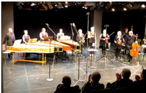
The Harukaze musicians stand proudly at the end of their performance