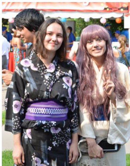
Attendees at last year's Obon Festival wearing kimono and enjoying the festivities.

We are excited to announce this year's Obon Festival at Como Zoo Park on August 19, 2018! The Obon Festival remains the largest Japan-related event in Minnesota; between the food, performances, cultural demonstrations and other activities, this festival is full of family friendly activities! The Obon Festival will conclude, as always, with the lighting of paper lanterns that are believed to guide the souls of ancestors back to their homes on Earth. Obon festival is the perfect way to learn about Japanese culture while eating traditional food and experiencing a beautiful spectacle on a summer evening.