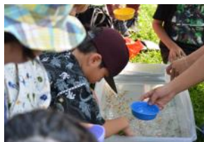
Children fishing for goldfish at the popular Kingyo Sukui booth

We are looking for volunteers for this year's Obon Festival. This is a great way for people who are interested in Japanese culture and meeting new people. Volunteers are compensated with free admission and an exclusive Obon Festival t-shirt.