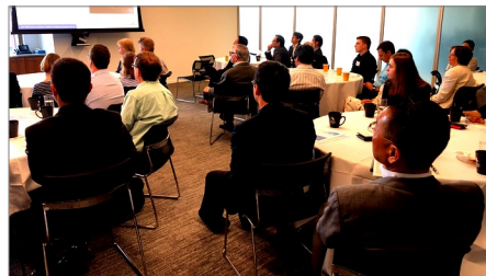
A full room of Corporate Roundtable attendees