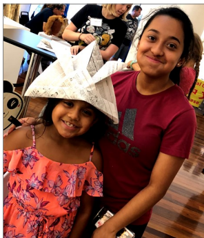
A girl with her new Samurai helmet

proudly carried the Japanese flag. At JASM's table, we taught festival attendees how to make Origami Samurai helmets and spread the word about upcoming JASM events. By the end of the day, people could be seen walking around the park adorned in their Samurai helmet, ready to go off to battle.