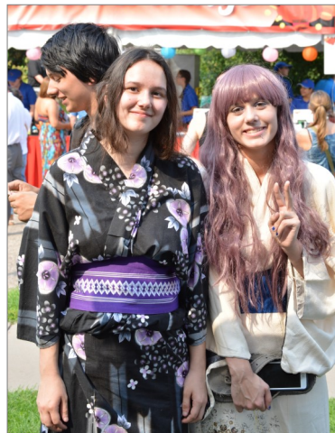
Attendees at last year's Obon Festival wearing kimono and enjoying the festivities

The 2018 Obon Festival at Como Park on August 19 is approaching fast! Dust off your kimono or last year's Obon Festival shirt and come join us in a celebration of Japanese culture. You can anticipate Taiko drumming, singing, martial arts, bonsai, Bon Odori dancing, and plenty of delicious food as well as the much-anticipated lantern lighting at dusk. Each year the festival grows, drawing more and more