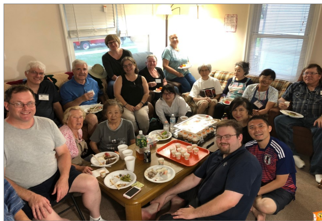
Volunteers relaxing after the busy day