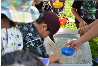
Children fishing for goldfish at the popular Kingyo Sukui booth

We are looking for volunteers for this year's Obon Festival. This is a great event for anyone who is interested in Japanese culture and would like to meet new people. Volunteers are compensated with free admission to the Festival.