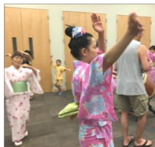
Member of Sansei Yonsei Kai dancing in her beautiful yukata