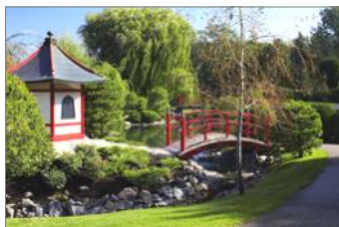
The Normandale Japanese Garden

From 11:00 a.m.-5:30 p.m. on September 23 , the Normandale Japanese Garden will be hosting its fifth annual Japanese Garden Festival, at 9700 France Avenue S., Bloomington, MN.