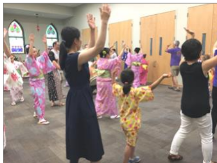
Participants learning traditional Japanese dances