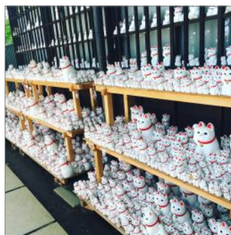
Cat Temple in Japan

If you find yourself in the Tokyo area, why not take a trip to visit Gotokuji Temple in the Setagaya ward? This small hole-in-the-wall temple located far from the hustle and bustle of the city features thousands of maneki-neko (lucky cats). From massive, waist-high cats to tiny pocket-sized cats, there is plenty of luck in the air. While at the temple, you can visit the gift shop to buy your own lucky cat, either to add