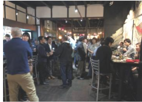
Know Me Kai Club at Saji-ya restaurant

On October 9 th , with the goal of welcoming new Japanese expats to Minnesota, "Know Me Kai Club" had a record number of 44 attendees, including expats, JASM members, and other guests. In Saji-ya restaurant in St. Paul, a warm welcome was shown to expats and their families by members of the community, while they shared experiences over food and drinks. Expats were able to relax in this casual