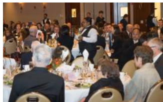
Mondale Gala 2017

With the Mondale Gala approaching quickly, we would like to inform our readers who wish to wear a kimono to the event that there is assistance available for kimono dressing. If you would like more information, please go to the Mondale Gala 2018 page on our website: mn-japan.org . Information will be kimono dressing assistance is near the bottom of the page.