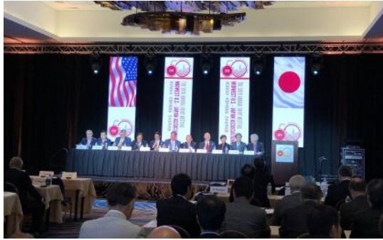
Panel discussion at the Midwest Japan Association Conference.