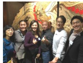
Attendees at Know Me Kai

On October 9 th , with the goal of welcoming new Japanese expats to Minnesota, "Know Me Kai Club" had a record number of 44 attendees, including expats, JASM members, and other guests. In Saji-ya restaurant in St. Paul, a warm welcome was shown to expats and their families by members of the community, while they shared experiences over food and drinks. Expats were able to relax in this casual