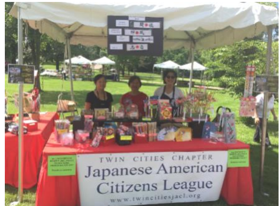
Twin Cities Japanese American Citizens League

The Japanese American Citizens League (JACL), founded in 1929, is the nation's oldest and largest Asian American civil and human rights organization. The JACL has worked to overturn more than 600 discriminatory laws and statutes and has been a leader in efforts to increase public awareness and understanding of racism. The organization monitors and responds to issues that enhance or threaten the civil and human rights of all Americans, and implements strategies to effect positive social change, particularly in the Asian Pacific American community. The JACL, headquartered in San Francisco, has seven district councils throughout the U.S. and an office in Washington, D.C. Its 106 chapters serve nearly 12,000 members.