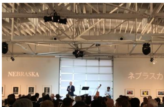
Midwest Japan Association Conference in Omaha, Nebraska

At the end of the conference, delegates from the Midwest and Japan reaffirmed their commitment to maintaining bilateral trade and investment through mutual cooperation, based on the strong trust cultivated over the years.