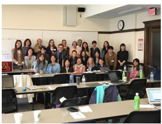
Minnesota Council of Teachers of Japanese