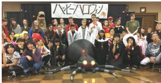
Students from Winona and Misato celebrating Halloween