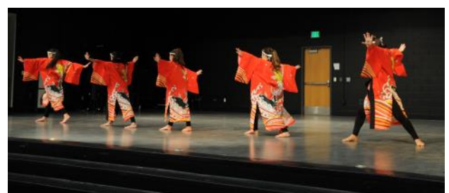
Dance group, New Thunder Wave, performing at Shinnenkai 2018

Shinnenkai is JASM's annual event which brings the traditions of a Japanese New Year celebration to Minnesota so that we can promote cultural exchange and new experiences in a fun environment. There will be cultural performances, delicious Japanese food, a silent auction, a raffle, and children's activities. We hope to create a fun family atmosphere that allows people of all ages to come together, meet other Japan-related groups, and experience a Japanese New Year! More information, including ticket prices, on page 4.