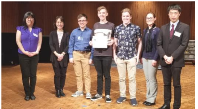
Level III winners from Shakopee High School