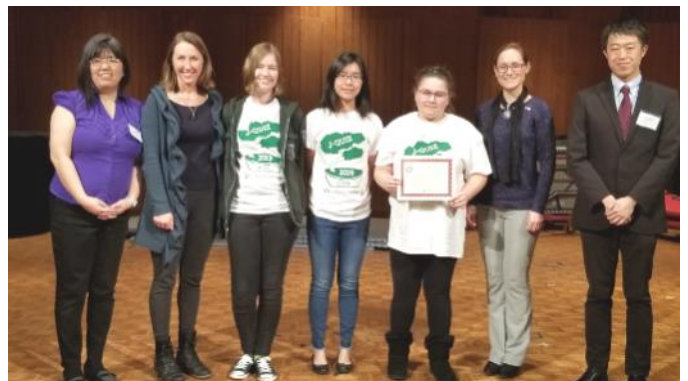
Level II winners from Eastview High School