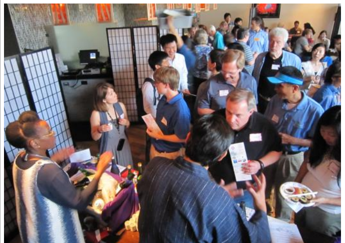
Sake Tasting event 2014

*Before this event, JETRO will be hosting Sake Math, Sake Tasting & Seminar for food and beverage professionals only . If you would like more information about this event go to: jetrosakeseminarminneapolis.eventbrite.com