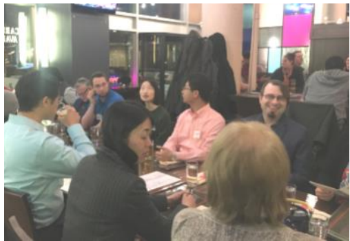
Attendees at our second Know Me Kai Club

topics. Business cards were exchanged and new friendships begun over delicious Japanese food and beverages.