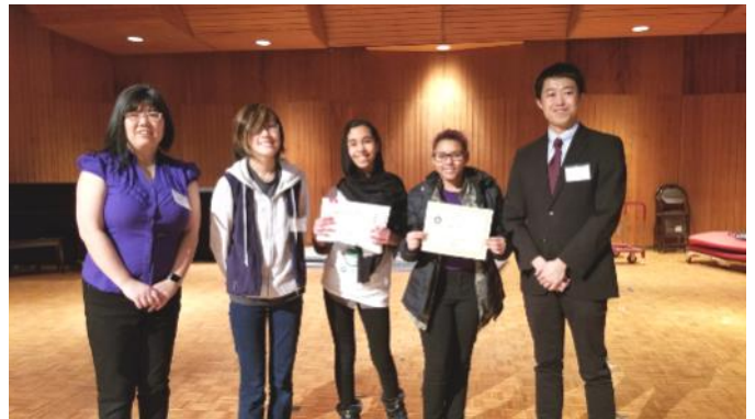
Level I winners from Shakopee High School

JASM would also like to thank Normandale, the students, teachers, judges, sponsors, and volunteers. Their contributions allow J-Quiz to happen. It is always incredible to see the talents and hard work that these students display every year.