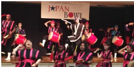
One of the cultural demonstrations at the National Japan Bowl 2019