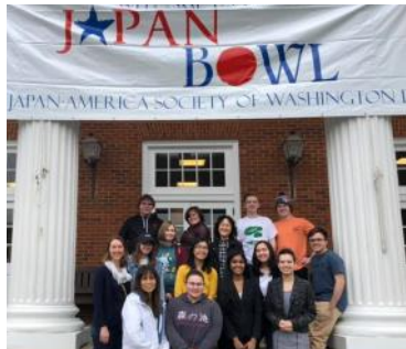
All the trip participants 2019

Despite heavy snow, Delta Air Lines safely flew winners of the 2019 J-Quiz competition to Washington, D.C. where they competed in the National Japan Bowl and attended the National Cherry Blossom Festival from April 11th– 13th. This year the J-Quiz second place winner of Level 4, Southwest High School, took the trip instead of the first place winner, Memorial High School--team B because Memorial was unable to make the trip. Also, Shakopee High School Level 2 students, who narrowly lost at the tie-break, decided to go to the National Japan bowl as well. They ended up winning fifth place nationally! Eastview High School Level 2 students won sixth place. Congratulation to both teams!