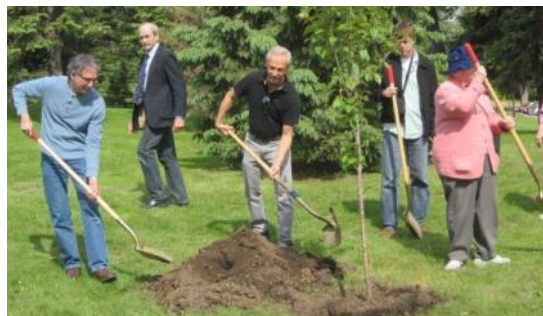
The cherry tree planting at the gift of trees celebration 2012

Through the years, SPNSCC has held many signature events, including, with JASM, the Obon Festival at Como Park, the Gift of Cherry Trees from Japan in 2012, the Return of the Sword in 2013, the Hiroshima Nagasaki Peace Exhibition at Landmark Center in 2015, and Urban Expedition to Japan at the Landmark Center in 2018. The SACHIKO scholarship assists students from Metropolitan State University attend a peace and environmental institute at Nagasaki University each summer.