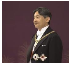
Japan's new Emperor Emperor Naruhito

His Majesty the Emperor Akihito of Japan abdicated on April 30. His Imperial Highness the Crown Prince acceded to the throne on May 1. The new era 令和 (Reiwa), meaning "Beautiful Harmony," has begun in Japan. Emperor Naruhito said in his first speech, "I swear that I will act according to the Constitution and fulfill my responsibility as the symbol of the State and of the unity of the people of Japan, while always turning my thoughts to the people and standing with them."