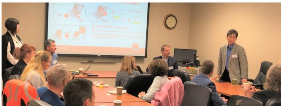
Corporate Roundtable with MGK