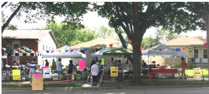
Garage Sale 2018