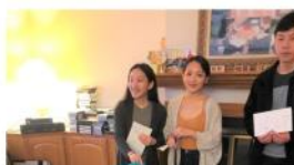
Students visit Nagomi Ya