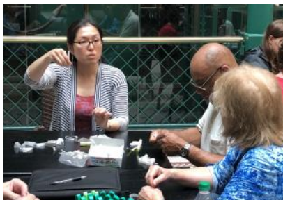
Volunteer workshop the day before the 2018 Obon Festival

I am originally from Kyoto, Japan and my family and many of my friends still live there. I have been living in Minnesota for 19 years. Although every winter, especially like this past winter, it makes me wonder why we still live here, this is my home now. JASM is a great way to stay connected to the culture of my home country while feeling very at home in my new country.