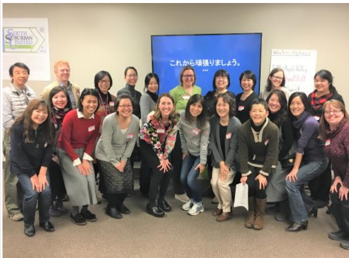
Minnesota Council of Teachers of Japanese at its first Shinnenkai in January

There are many exciting events going on in the coming year for MCTJ. In May 2020, Macalester College will host the 28th Conference of the Central Association of Teachers of Japanese (CATJ) on May 30-31, 2020. They will be bringing together language professionals from across the US and Canada to share their research and ideas on best practices in teaching and advising.