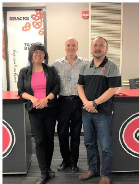
St. Cloud State University visit