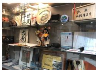
Cambridge Sister City visit