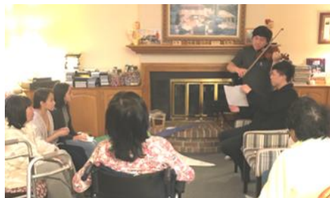
A student plays music for the residents

In April, students from Harding High School made another visit to Nagomi Ya Senior Living in Apple Valley. During their visit, they performed songs and made crafts, among other activities. Importantly, they also provided companionship to the residents of Nagomi Ya. Nagomi Ya, one of our corporate members, is a care home for Japanese seniors with multiple locations in Burnsville and Apple Valley.