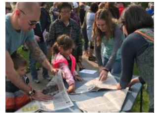
Festival-goers learn how to make an origami samurai helmet with JASM

On June 1 st at Como Park, the Saint Paul-Nagasaki Sister City Committee hosted an event to celebrate the seventh anniversary of the gift of twenty cherry trees from Japan.