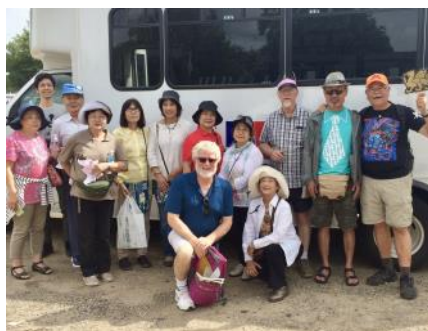
The group from Yuasa, Japan and their friends from Cambridge after a day at the Minnesota State Fair