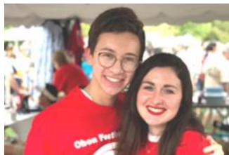
Volunteers at the 2018 Obon Festival

We are looking for volunteers for this year's Obon Festival. This is a great way for people who are interested in Japanese culture to meet new people. Volunteers are compensated with free admission and an exclusive Obon Festival T-shirt.