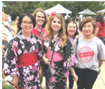
2018 Obon Festival Attendees

Mark your calendars! The 2019 Japanese Obon Festival is Sunday, August 18th at Como Park Zoo & Conservatory. Join us for a day that celebrates the rich culture of Japan. Look forward to drumming, singing, dancing, delicious food, martial arts, and – of course – the lantern lighting at dusk. The Obon