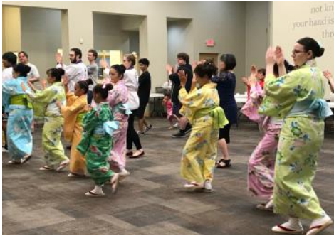
Dancers at the Bon Odori Workshop

seasoned veterans of Bon Odori, while it was the first time learning these dances for others. No matter the skill level, everyone was able to participate and have a good time. At the workshop, Sansei Yonsei Kai taught dances for both traditional Japanese music as well as modern music, including songs by Justin Timberlake and Bruno Mars. This mix of music was a fun way to show how tradition can be adapted to stay alive in modern times.