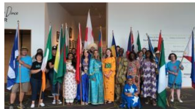
People representing various countries at the festival

On Saturday, July 20th, JASM staff and interns traveled to Burnsville to participate in its annual International Festival. Although the day started out rainy, the weather