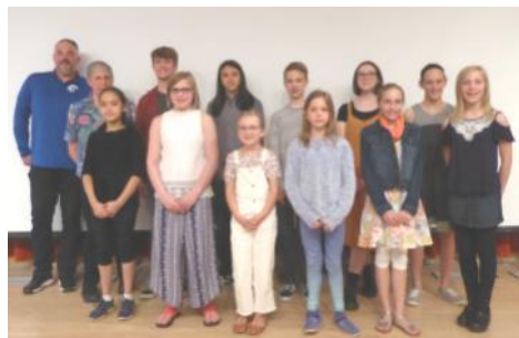
Some winners of the 2019 Haiku Contest

One of its longest running programs is the Annual Haiku Contest, where Minneapolis Public School Students are invited to write and submit haiku on the current year's theme. This contest has grown with the help of Minneapolis School teachers to approximately one thousand entries every year! Winning students receive certificates and gifts from Ibaraki at an awards ceremony each spring.