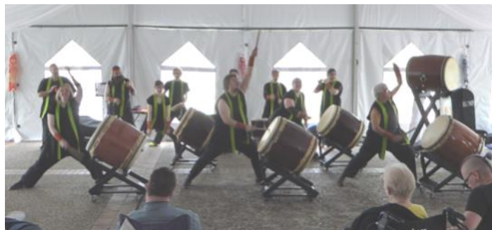
Harisen Daiko performing at the May 2019 MISCA Cherry Tree Festival on Nicollet Island

To fulfill its mission – which is to build goodwill, friendship and opportunities between the two cities – MISCA has sponsored many different cultural exchanges and programs throughout the years. Current programs offered by MISCA in Minneapolis are its Cherry Tree Festival each May, participating in Minneapolis's Sister Cities Day each July, and Holidazzle each December, where we provide opportunities for participants to learn about Japanese activities, history, and culture.