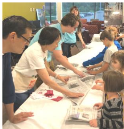
JASM booth at Normandale