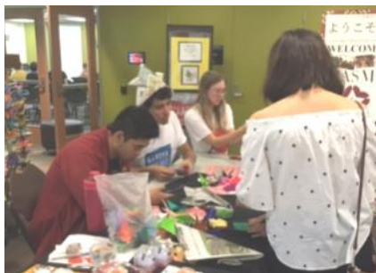
JACL members folding paper cranes at their Normandale booth

more. There were Ikebana displays by Ikebana International and performances by Taikollaborative and Harisen Daiko. In the gymnasium, MN Kyudo Renmei, Toyama Ryu Batto Jutsu, Five Elements Martial Arts Laido, and South Metro Authentic Ancient Arts demonstrated their swords, archery, and karate skills. Attendees were also able to enjoy dance performances by Sansei-Yonsei Kai (SYK) outside in the Japanese garden.