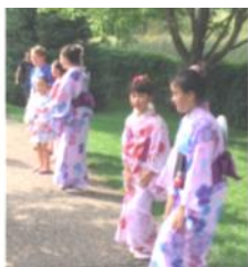
SYK performers at Normandale