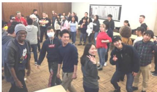
Students at one of JP Network's weekly meetings

The JP Network of St. Cloud State University is a student group dedicated to educating American students about Japanese culture and Japanese students about American, or more specifically, Minnesota culture. As a student group they host a variety of Japan themed events ranging from