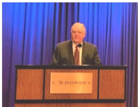
Ambassador Walter Mondale at Global Minnesota's Japanese business panel

Over the week of September 16th, Global Minnesota organized several events which were sponsored by the Sasakawa Peace Foundation USA (SPFUSA). These events revolved around Japan-America relations in business and how they affect Minnesota businesses as well. Ambassador