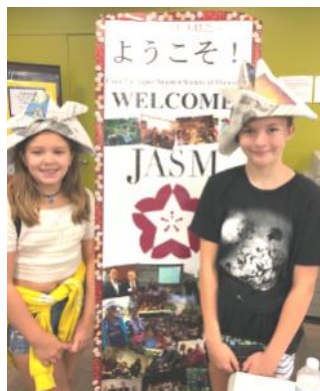
Visitors to JASM booth wearing origami samurai helmets

On Saturday, September 21st, Normandale Community College hosted their annual Japanese Garden Festival. The forecast for the day had previously been rainy, but when the time came there was only a light shower so the day was perfect for enjoying the beauty of Normandale's Japanese garden.