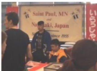
SPNSCC booth at Normandale