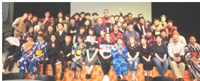
JP Network's Japan Night 2019

Undokai (known in Japan as Sports Day), their own Japan Night, and even Taiko performances, to simply enjoying karaoke, cooking, or playing games together at their weekly meetings. Since 2005, the JP Network of St. Cloud State University has been a place for students of all backgrounds to come together, have fun, learn a little bit more about each other, and make friendships that transcend cultural boundaries.