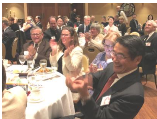
The Consulate General of Japan in Chicago with attendees at the 2018 Mondale Award and Scholarship Gala