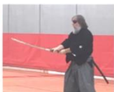
Toyama Ryu Batto Jutsu at Normandale