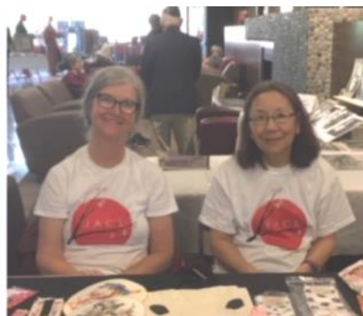
JACL booth at Normandale