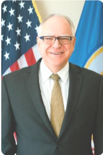
Minnesota Governor Tim Walz

Every fall, JASM hosts the Mondale Award and Scholarship Gala. At this event we present the Mondale Award for Japan-Minnesota Partnership and the Mondale Scholarships. At each gala, we feature a keynote speaker to further enhance Japan-Minnesota relations. We are honored to announce that our keynote speaker for this year's Mondale Gala is Minnesota's 41st Governor, Tim Walz.