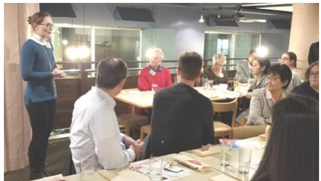
Attendees at the 2018 Annual Meeting

The annual meeting is free to attend, but Bonenkai will be $23 for JASM members and $30 for non-members. Please RSVP to this event by going to our website at mn-japan.org or by scanning the QR code above.