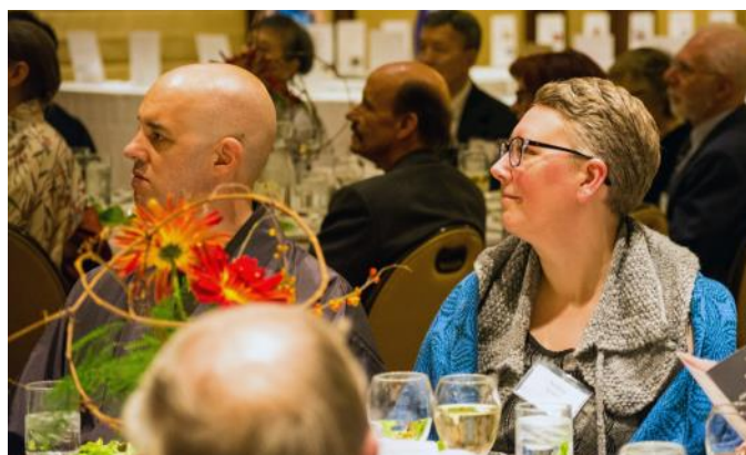
Attendees in the main hall at the Mondale Gala

Thank you to everyone who attended this year's Gala. We are so thankful for your contributions and your dedication to JASM. It is thanks to all of you that this year's Gala was another success. We look forward to another fantastic year with all of you.