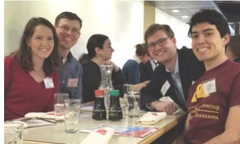
Attendees at the 2018 Annual Meeting

The end of the year is just around the corner, which means that it is time for JASM's annual meeting and Bonenkai. Please join us on Tuesday, December 17th