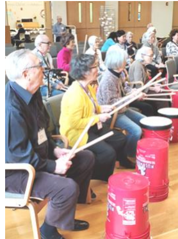
Nikkei Project members at one of their meetings

Back in September of 2018, JASM began a series called MN Grassroots Development to highlight organizations striving toward good US-Japan relations, and give them a platform to showcase what they have been doing over the past years and what they are planning for the future. This month’s organization is the Minnesota Nikkei Project .