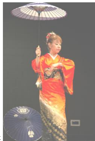
Dancer at 2019 Shinnenkai performance

On Sunday, January 26th, JASM will be hosting our annual Shinnenkai celebration. Every year we host this event to bring a taste of the Japanese New Year celebrations to Minnesota. There will be taiko and dance performances, Japanese food, a silent auction, and children's activities. So mark your calendars for this special celebration that the entire family can enjoy.