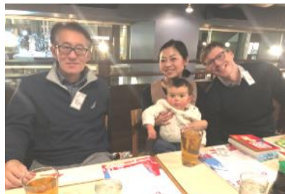
Attendees enjoying each other's company at Bonenkai

Afterward, we celebrated the end of the year with a traditional Bonenkai celebration. Bentos and drinks were supplied through Sakura Restaurant. Guests enjoyed the company of new and old friends as they said goodbye to 2019.