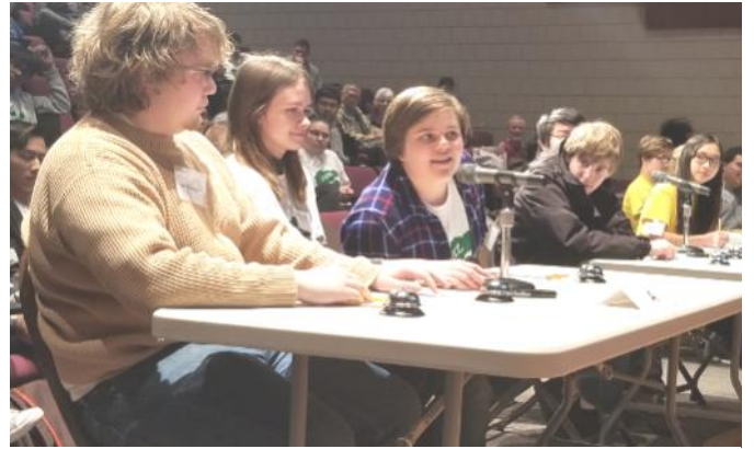
Students participating in J-Quiz 2019

J-Quiz 2020 is right around the corner. On Saturday, February 15th high school students from across Minnesota and Wisconsin will be gathering at Normandale Community College to test their knowledge of Japanese language and culture.