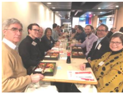
Attendees at 2019 Annual Meeting and Bonenkai

On December 17th many guests gathered at Sakura Restaurant in St. Paul for JASM's Annual Meeting and Bonenkai events.