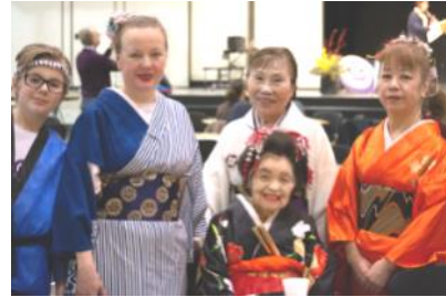
Performers at Shinnenkai 2019

Every year we here at JASM like to celebrate the coming year in the traditional Japanese way. At JASM's Shinnenkai event we welcome the new year with dance, vocal, and instrumental performances along with plenty of activities for the entire family to enjoy.