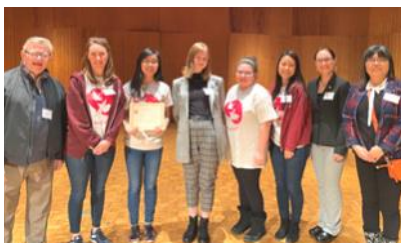
Level III from Eastview High School

The winners of level II to IV are as follows: