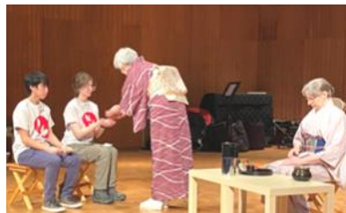
Tea ceremony presented by Yukimakai