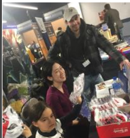
Anime Detour 2019