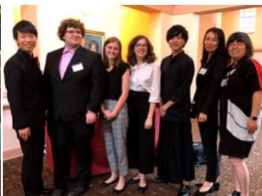
JASM team with the artists at Harukaze concert 2019

Please thank our members with your support!