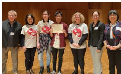
Level II from Shakopee High School (Pic. Revised)