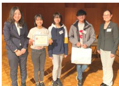
Level I from Shakopee High School

Three teams of level II to IV students advanced into the final rounds. They took part in a game-show style competition in front of the audience. In the end, the top team of each level won a trip to Washington, D.C. to compete in the National Japan Bowl in April. Of 25 teams competing, three teams emerged as final victors. Starting this year, the new Ken Port Scholarship will support part of the Japan Bowl expenses for Level IV team winners.