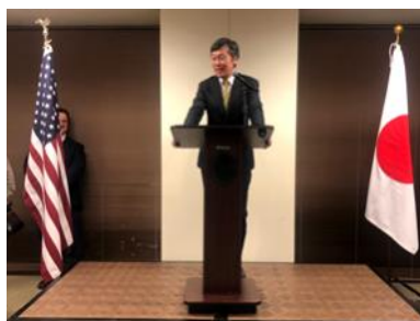
Consul-General Kenichi Okada, Consul-General of Japan in Chicago