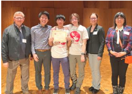
Level IV winning team from Harding High School

On Saturday, February 15, JASM presented one of our exciting annual events, J-Quiz, at Normandale Community College in Bloomington. This year, 88 students participated, from six Minnesota high schools and one Wisconsin high