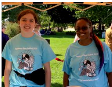
Obon Festival 2019 at Como Park