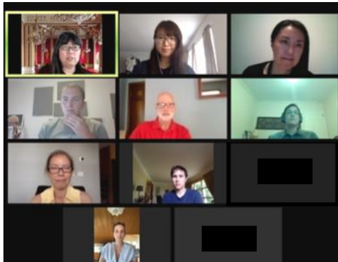
New Member Social 2020