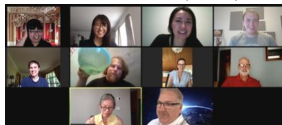
New Member Social 2020