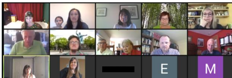
Curator Talk for Mia Exhibition Yoshitoshi: Master Draftsman Transformed