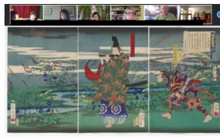
Curator Talk for Mia Exhibition Yoshitoshi: Master Draftsman Transformed