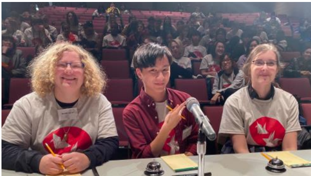
2020 Level 2 Winning Team from Shakopee High School

This year, 42 students of four schools will compete using their knowledge of Japanese language and culture. Viewing of this year's J-Quiz is limited to the participating students.