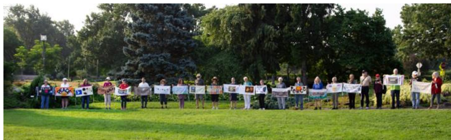
Photos: Commemorative Tea Ceremony, Thursday, August 5th, and Ceremony of the Cranes, Friday, August 6th