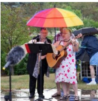
Photos: Nagasaki Commemoration, Sunday, August 8th