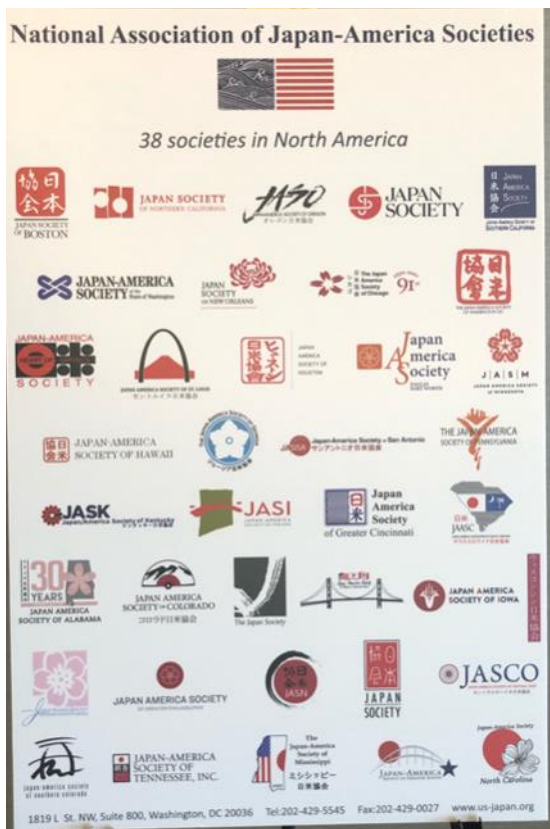
38 Japan America Societies in North America