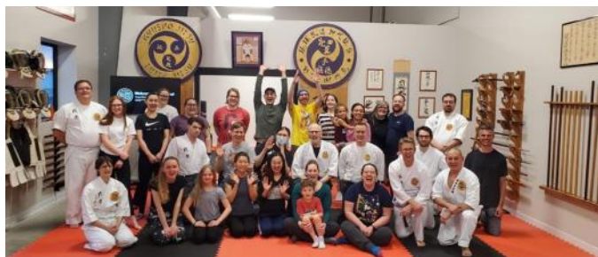
FMJ Field Trip - Hidden Teaching Okinawan Karate Dojo on May 9th