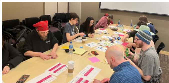
FMJ Origami Meet n Greet on April 9th

JASM would like to showcase Japan-related activities in North Dakota, where there is no Japan America Society or similar group. To support and put our neighbors in the spotlight, we started this new occasional series.