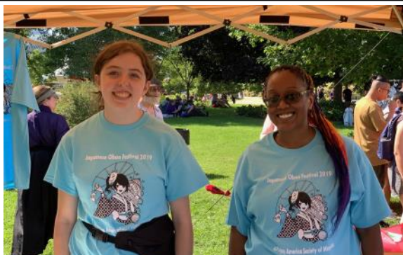
Obon Festival 2019

Are you interested in a career in international business or international relations? Do you have an interest in Japan or speak Japanese? If the answer is yes, the Japan America Society of Minnesota (JASM) has an opportunity for you!