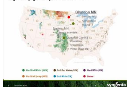
AgriPro/Syngenta key stations in the US