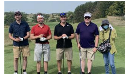
2022 JASM Charity Golf Scramble participants

JASM will be holding our 3rd annual charity golf scramble event on Saturday, September 23 at Pioneer Creek Golf Course in Maple Plain, MN.