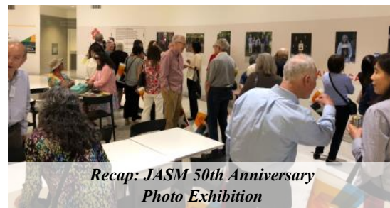
Recap: JASM 50th Anniversary Photo Exhibition