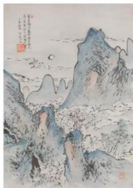
Moon over Azure Mountains, January 1899 Bachmann Eckenstein Japanese Art, Switzerland