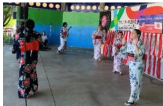
Schroeder Middle School Japanese Culture club Bon dance performance