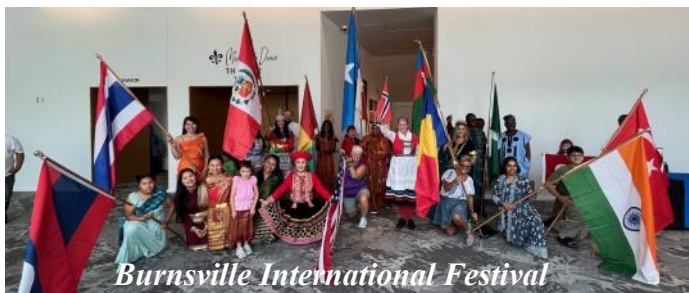
Burnsville International Festival