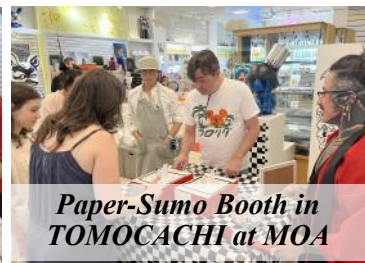
Paper-Sumo Booth in TOMOCACHI at MOA