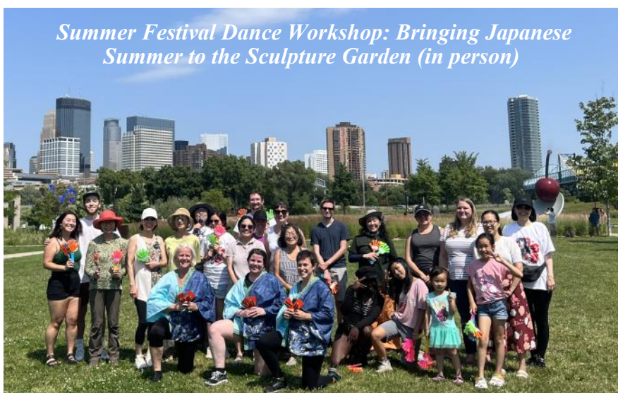
Summer Festival Dance Workshop: Bringing Japanese Summer to the Sculpture Garden (in person)