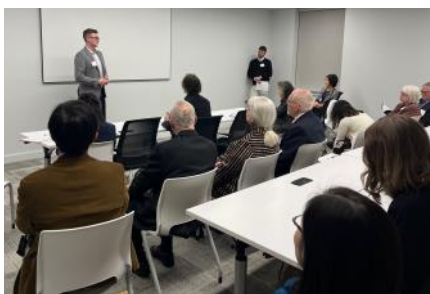
2022 Annual Meeting at MGK Company, JASM corporate member

It is time for JASM's annual meeting. The Annual Meeting will be held on Wednesday, December 13th at 6:30 pm at the offices of JASM corporate member Taiyo International, Inc.