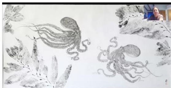
Octopus Pair, 2022