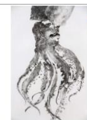
Hawaiian Squid, 2022 & Detail