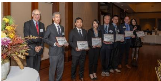
2023 Mondale Award Scholarship Gala Sponsors