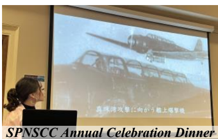
SPNSCC Annual Celebration Dinner