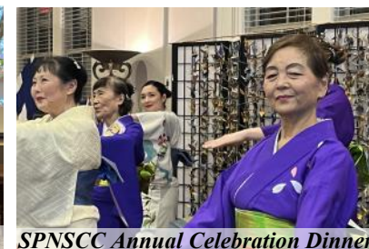
SPNSCC Annual Celebration Dinner