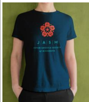
Proposed t-shirt design

To continue our mission of enriching the life of Minnesota, by being a bridge between Minnesota and Japan, we finally created a JASM T-shirt that you can wear year round! Let people know that you are a friend of Japan/Minnesota by carrying JASM's sakura and NorthStar logo over your heart.