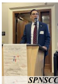
SPNSCC Annual Celebration Dinner